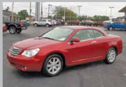
2008 CHRYSLER SEBRING Limited, 81,000 miles