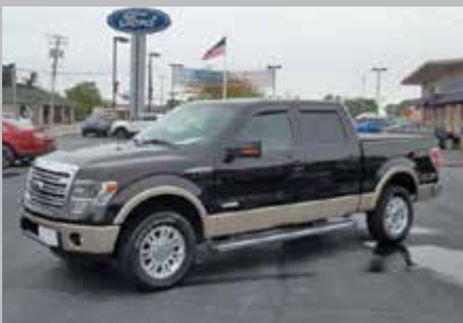
2013 FORD F-150 LARIAT Crew Cab, 43,000 miles