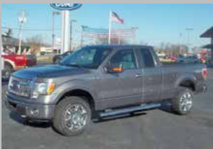
2013 FORD F-150 Ext. Cab, 44,000 miles