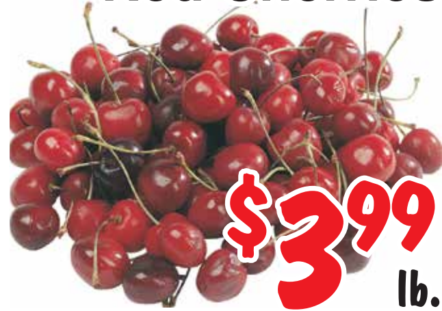
California Red Cherries