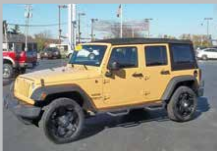
2013 JEEP WRANGLER UNLIMITED 17,000 miles