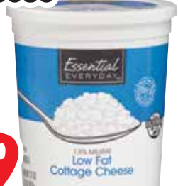
24 oz. Select Varieties Essential Everyday Cottage Cheese