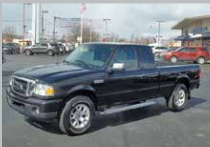
2009 FORD RANGER 74,000 miles