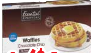
12.3 oz. Select Varieties Essential Everyday Waffles