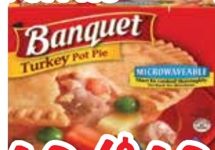
6.5-7 oz. Select Varieties Banquet Pot Pies