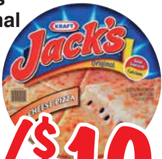
12 in. Select Varieties Jack's Original Pizza