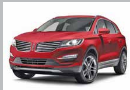
2015 LINCOLN MKC 36,000 miles