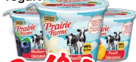
6 oz. Prairie Farms Yogurt