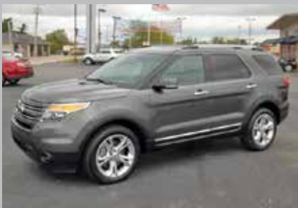
2015 FORD EXPLORER Limited, 4WD, 37,000 miles