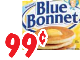
1 lb. Light or Original Blue Bonnet Vegetable Spread Quarters