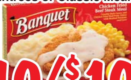
4.85-11.88 oz. Select Varieties Banquet Basics Entrees or Classic Meals