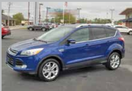
2014 FORD ESCAPE TITANIUM 44,000 miles