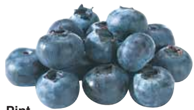
Pint Southern Blueberries