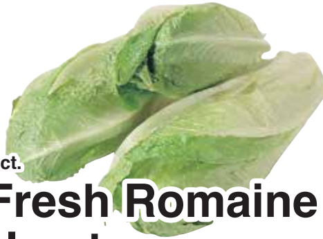
3 ct. Fresh Romaine Hearts