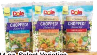
12-14 oz. Select Varieties Dole Chopped! Salads