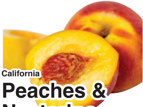
California Peaches & Nectarines