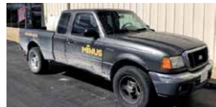
2004 FORD RANGER XLT 4x4, 157,000 Mi.