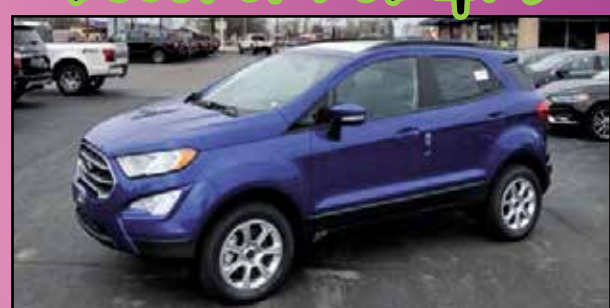
NEW 2018 FORD ECOSPORT SE 4WD