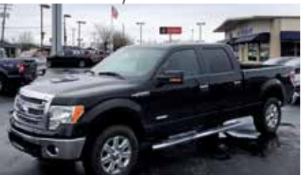
2013 FORD F-150 Crew Cab, 3.5L, 90,000 Mi., Just In, One Owner