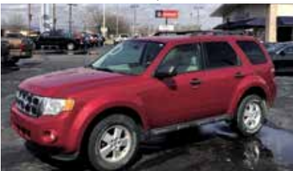
2011 FORD ESCAPE XLT 144,000 Mi.