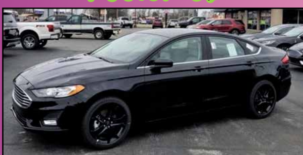
NEW 2019 FORD FUSION SE