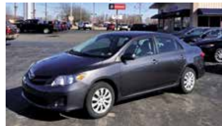
2012 TOYOTA COROLLA LE 55,000 Mi.