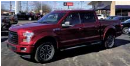
2017 FORD F-150 XLT Crew Cab, 5.0L, 32,000 Mi.