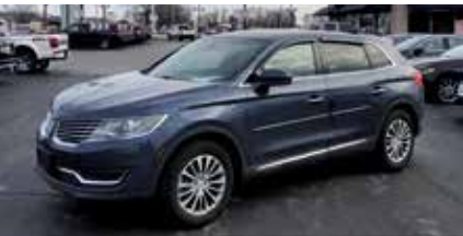
2016 LINCOLN MKX 65,000 Mi., Just In!