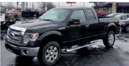
2014 FORD F-150 XLT SuperCab, 55,000 Mi.