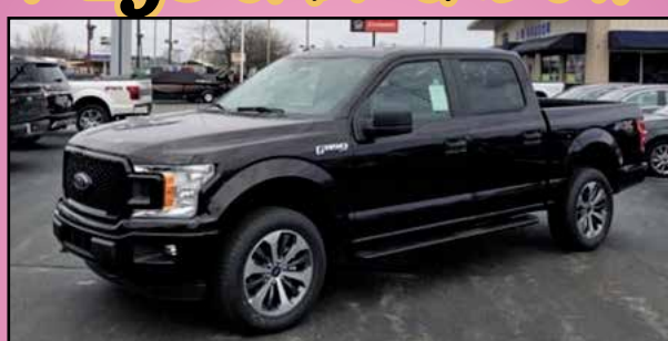
NEW 2019 FORD F-150 CREW CAB STX