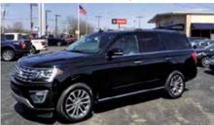
2018 FORD EXPEDITION LIMITED 36,000 Mi.