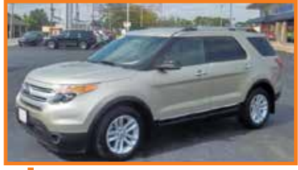
2011 FORD EXPLORER XLT 72,000 Mi.