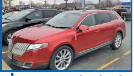
2010 LINCOLN MKT AWD 82,000 Mi.