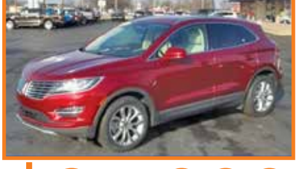
2015 LINCOLN MKC AWD 35,000 Mi.