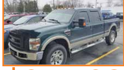
2009 FORD F-350 SUPER DUTY LARIAT 165,000 Mi.