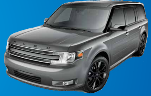
New 2018 Ford Flex SEL AWD

MSRP $39,555 Stock#2309 DOBSON DEAL $34,464