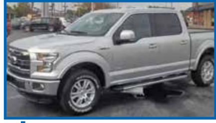
2015 FORD F-150 LARIAT 41,000 Mi.