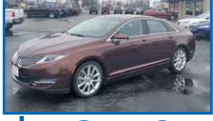
2015 LINCOLN MKZ 49,000 Mi.