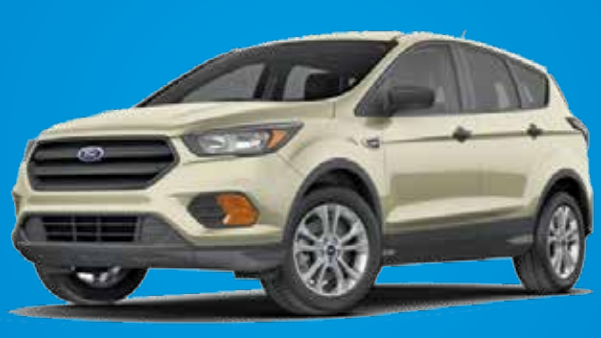
New 2018 Ford Escape S

MSRP $25,440 Stock#2372 DOBSON DEAL $21,793