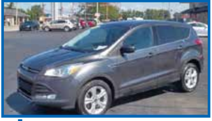
2015 FORD ESCAPE SE 38,000 Mi.