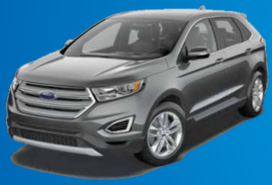
New 2017 Ford Edge SEL

MSRP $34,805 Stock#2218 DOBSON DEAL $29,000