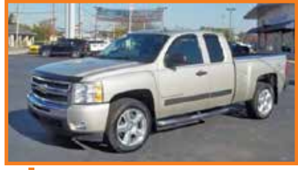
2009 CHEVROLET SILVERADO 1500 104,000 Mi.