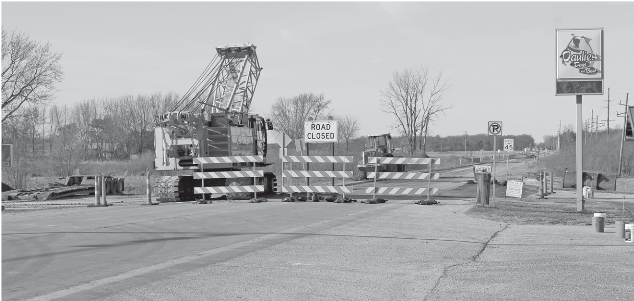
On March 21, the project was underway.

Subscribe to the Pulaski County Journal 24 hours a day at www.pulaskijournal.com