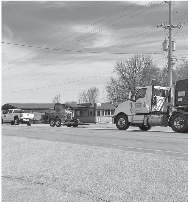
On March 20, INDOT began preparing for the resurfacing project to begin by moving in different equipment.