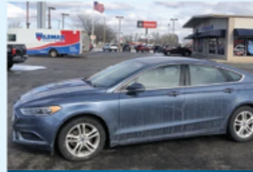
2018 Ford Fusion SE Just in! 42,000 mi.