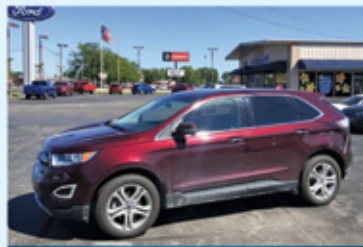
2019 Ford Edge ST AWD 21,000 mi.