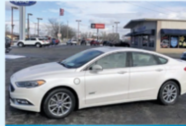
2018 Ford Fusion Energi Platinum 33,000 mi.