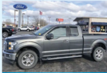
2017 Ford F-150 XLT 63,000 mi., just in!