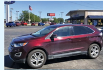
2017 Ford Edge Titanium FWD 57,000 mi., reduced price!