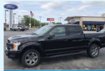
2018 Ford F-150 XLT Crew Cab 77,000 mi.