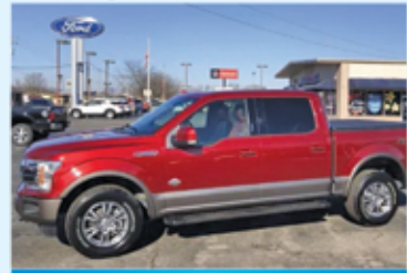
2018 Ford F-150 Crew Cab King Ranch, 46,000 mi.