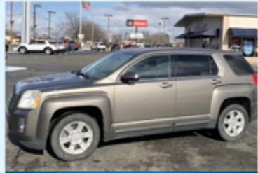
2011 GMC Terrain SLE FWD 96,000 mi., just in, local trade