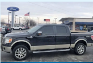
2009 Ford F-150 Crew Cab King Ranch, 126,000 mi.